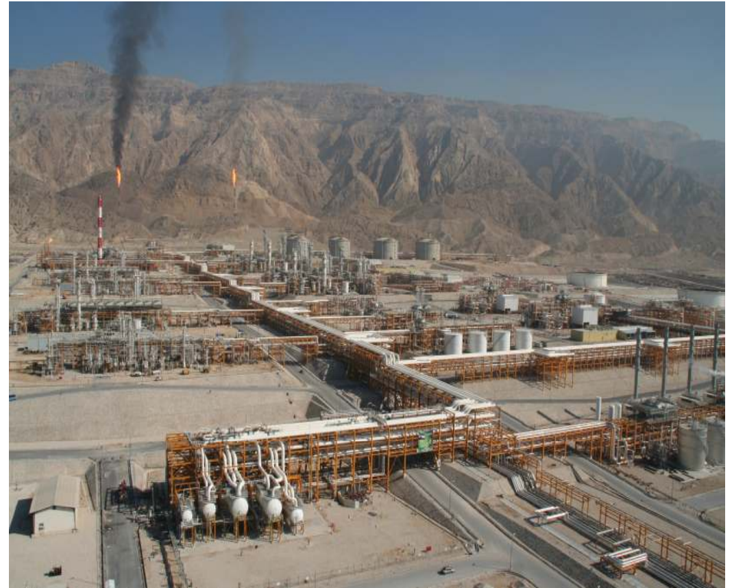
<Iran, SP 9~10 Project>